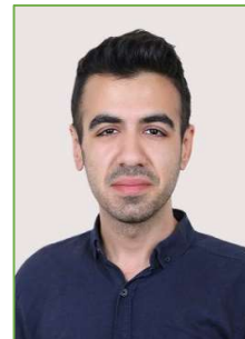
Istanbul Technical University Faculty of Economics