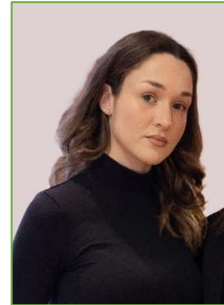
University of Belgrade Faculty of Law