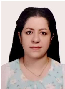
University of Turin Faculty of Law