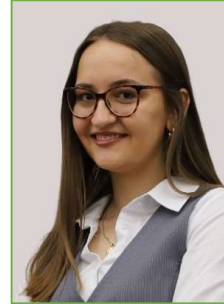
University of Belgrade Faculty of Law