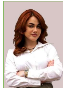
University of Belgrade Faculty of Law