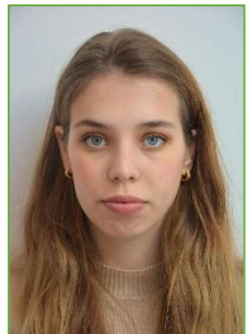
University of Ljubljana Faculty of Law