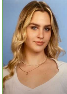
University of Ljubljana Faculty of Law