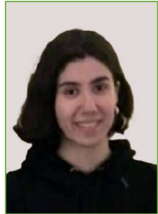
University of Turin Faculty of Law