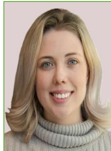
George Mason University College of Social Sciences