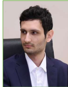
University of Illinois Faculty of Economics