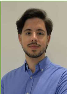
University of Belgrade Faculty of Law