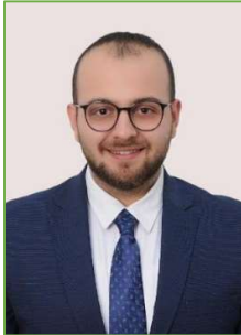
Istanbul Commerce University Faculty of Law