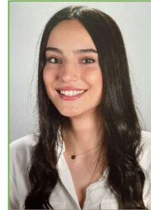
University of Belgrade Faculty of Law