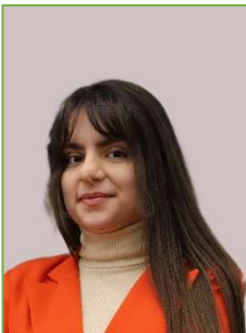
University of Belgrade Faculty of Law