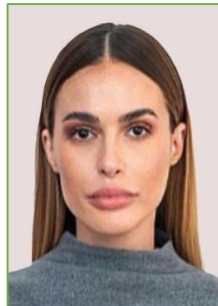
Ss. Cyril and Methodius Faculty of Economics