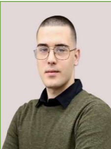
University of Belgrade Faculty of Law