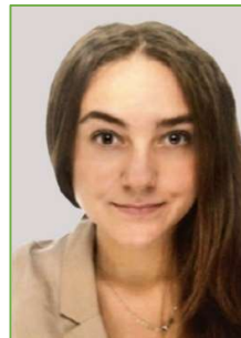
Vienna University of Economics and Business