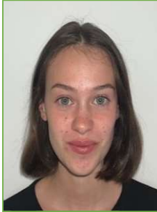
University of Ljubljana Faculty of Law