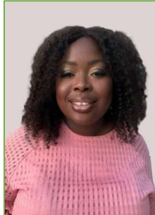
Vrije University Faculty of Humanities