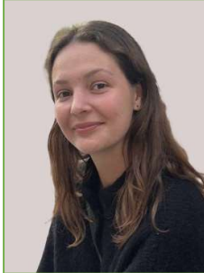
University of Copenhagen Faculty of Law