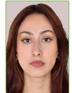
Baku State University Faculty of Law