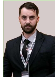
Aristotle's University of Thessaloniki Faculty of Law