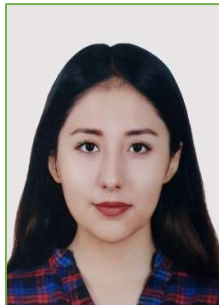
Ankara University Faculty of Law