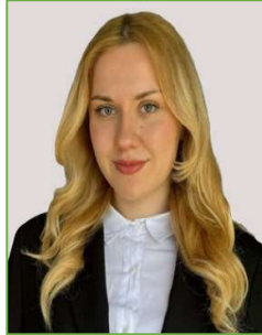
Izmir University Faculty of Economics