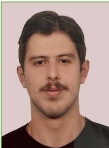
Bilkent University Faculty of Law