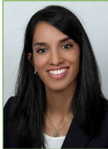
FernUniversität in Hagen Faculty of Law