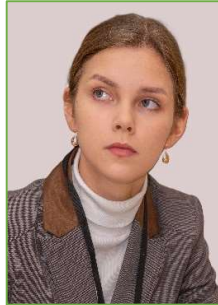
National Research University Higher School of Economics