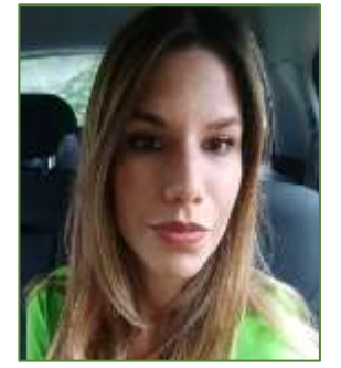
University of Bologna Faculty of Law