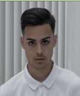
Democritus University of Thrace