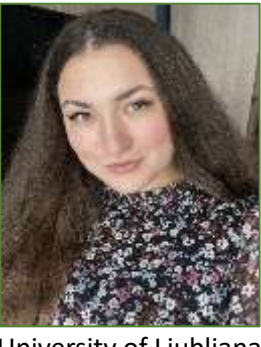
University of Ljubljana Faculty of Law