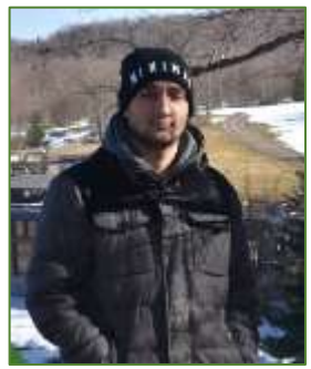
University of Sarajevo Faculty of Law