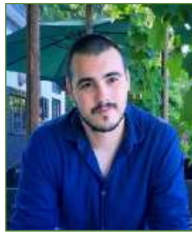
University of Ljubljana Faculty of Law