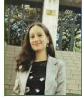
University of Kragujevac Faculty of Law