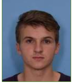
Charles University Faculty of Law