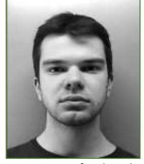
University of Belgrade Faculty of Law