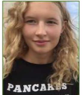
Charles University Faculty of Law