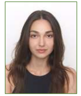
University of Belgrade Faculty of Law