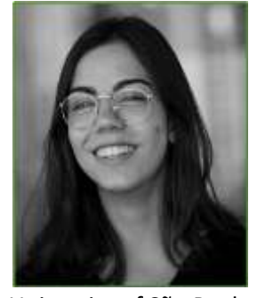
University of São Paulo Faculty of Law