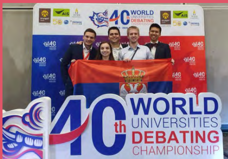
Students of the Faculty of Law won the 2nd place at the 40th World Universities Debating Championship which took place in Thailand.

signed and equipped as a courtroom for students preparing for these competitions. The following competitions, in which previous generations of the Faculty's students have excelled, are just some of the options students have before them: