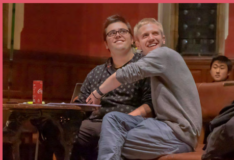
Members of the Faculty's Debate Club won the 1st place at the oldest and most prestigious debate competition in the world - Oxford Intervarsity 2019. It was the first time that a team from a non-English speaking country won this outstanding prize.